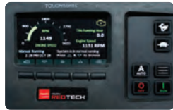
ISUZU REDTECH™ TOUGH SERIES PRO PN# 5Y3-146

CUSTOMIZATION: Less display customization and wiring is more traditional.