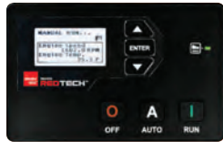
ISUZU REDTECH™ TOUGH SERIES PN# 5Y3-149

Good for mobile generators. Simple control with fewer monitoring options.